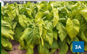
Figure 3: Kutsaga bred varieties bred; showing robust growth and well adapted to the local conditions guarantee high yields and good leaf quality.

Should there be other varieties from other countries growers may need, an industry agreed variety and agronomic testing protocol is available and is supervised by both the Agricultural Research and Innovation Services (formerly Department of Research and Specialist Services) and TIMB. Currently Kutsaga is working with Alliance One international and Cavendish Lloyd Zimbabwe in testing varieties from Europe and South America for suitability and adaptability to Zimbabwe conditions.