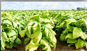
Figure 4: The exceptional Kutsaga genetics showcasing outstanding performance demonstrating impressive yields & robust growth; K RK75, K RK74, K RK66 and K RK72 varieties.