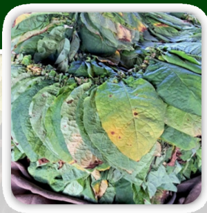
Figure 1: Leaf and field Images from a farmer from Gutu, Masvingo, who unknowingly bought cigar wrapper type seed from unauthorized and unscrupulous sources, thinking it was flue cured, only to realize the mistake at reaping. The grower intended to grow flue-cured Virginia, heavily lost all their season's investment.

Our unique tobacco attributes are safeguarded by proven and widely adapted locally bred genetics as well as tested and approved foreign varieties. Rigorous industry-wide testing protocols (including agronomic, chemical, smoke quality) guarantee the sought-after quality of all tobacco varieties bred locally or imported in Zimbabwe. Below (Fig 1 & 2) are recent and unfortunate scenarios where growers unknowingly bought and used seed/seedlings for 4 ha in the 2024-25 season that turned to be a cigar wrapper type of tobacco and not the intended flue cured type.